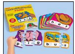
Twist & Turn Word Builders (L 443)

Three and four letter puzzle sets featuring familiar words in a self correcting format.