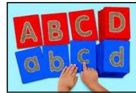
Tactile Letters (L 453)

The tactile letter set allows children a sensory experience with the shape of a letter as they run their fingers over its rough surface. These letters can also help in the development of a muscle memory of how to form the letter.