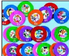
Search and Find Alphabet Bags (L 452)

The Resource Centre has many new literacy learning materials and books available to support you in your work. Here is a small sampling. You can look for membership information and an updated inventory list at www.nscece.ca