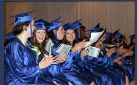
Professionalism and Advocacy Class Class of 2015 Nova Scotia College of Early Childhood Education

to learn. The development of an affordable, accessible, and high quality early education system delivered by credentialed early childhood educators is an investment in families and in our communities. As future early childhood educators we see the impact that early education has on all children. We also recognize the long term impact that a family and child friendly system would have on the birthrate, poverty reduction, our economy and our collective wellbeing. By investing in children and families we create a strong, healthy, vibrant population. This in the best interests everyone.